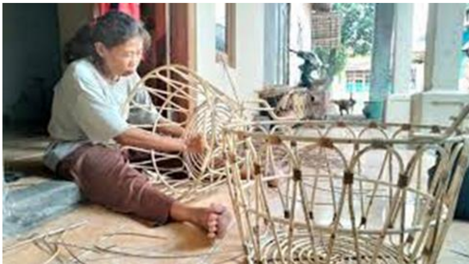
Image-2 Rattan craftsmen with product innovation.

Cultural sustainability dimension, this component highlights the significance of cultural sustainability as a guiding principle. It encompasses the preservation of cultural heritage, practices, traditions, and values. It also addresses the importance of intergenerational knowledge transfer, community engagement, and maintaining cultural identity over time. Industrial Partnership Aspect, the industrial partnership dimension focuses on collaborative efforts between different stakeholders, such as businesses, artisans, designers, and local communities. It explores the goals, structures, and mechanisms of these partnerships, highlighting how industries can contribute to cultural sustainability. On the aspect shared values and objectives within the framework, emphasis is placed on aligning the values and objectives of industrial partners with cultural sustainability goals. This involves understanding and respecting the cultural significance of products, ensuring that partnership activities contribute positively to cultural heritage, and promoting ethical business practices. Impact of inclusive decision making the framework underscores the importance of involving local communities, artisans, and cultural experts in decision-making processes related to industrial partnerships.